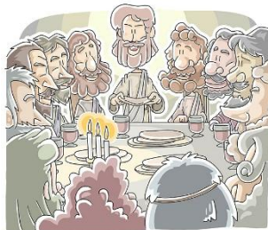
Luke 22: 14-23 The Last Supper The Eucharist is linked with the Jewish celebration of Passover.