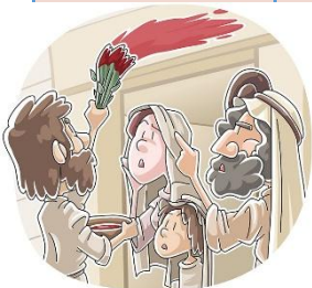
Exodus 12:1-8, 15-20, 13:3 The Passover