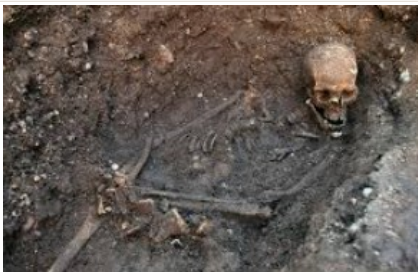
King Richard III was found buried under a car park in Leicester

The discovery of Richard III August 2012