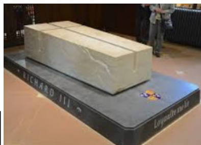
King Richard III is now buried in Leicester Cathedral