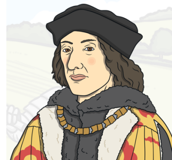
Henry Tudor 1457 - 1509

Henry Tudor was born in Wales and was part of the House of Lancaster family. He grew up to become earl of Richmond and believed he was a rightful heir to the throne of England. He had support from the enemies of the current king, Richard III, as well as France.