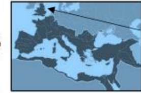
Britain Roman Empire