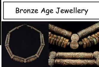
Bronze Age Jewellery