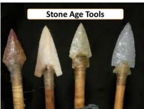
Stone Age Tools