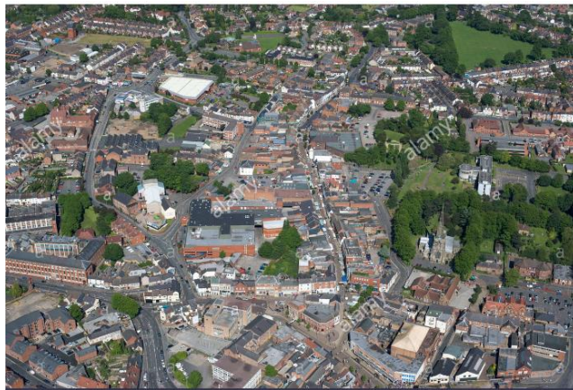
Hinckley – a town