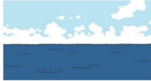
sea or ocean