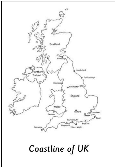
Coastline of UK